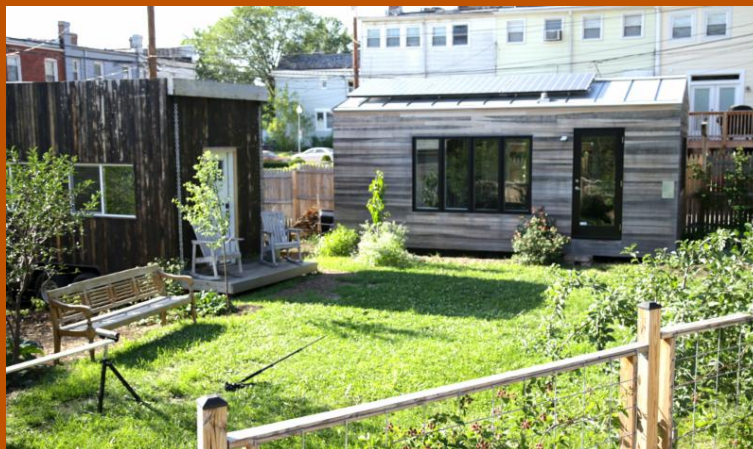
Minim House, center, at Boneyard Studios.