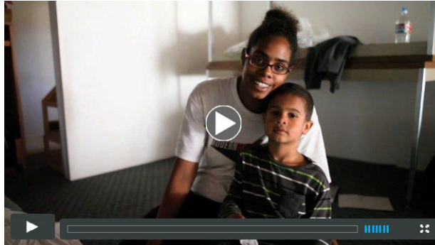
Needs of People Who Are Homeless