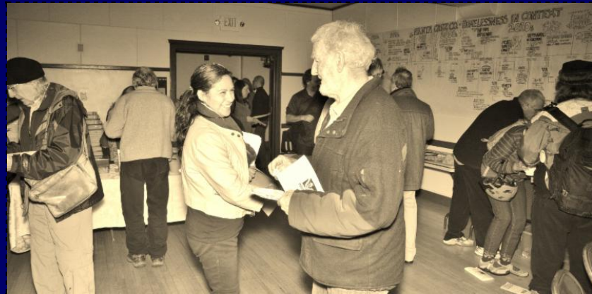
The community provided input on the Countywide Strategic Plan to End Homelessness on Dec 4, 2014 in Santa Cruz